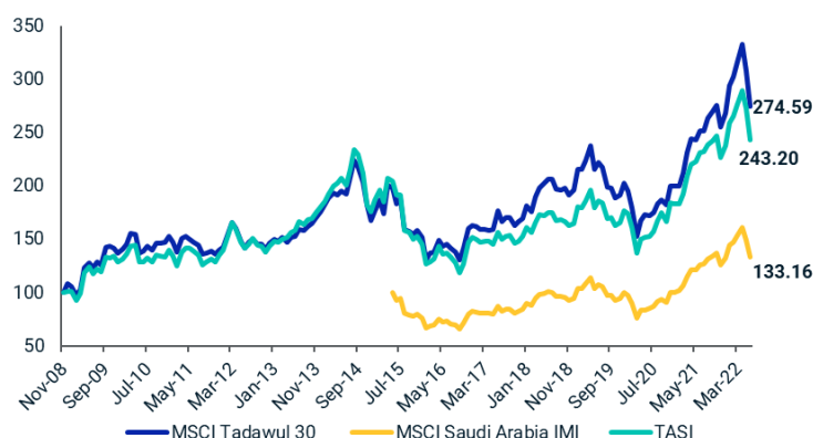
SAR Price Returns (%) Nov 2008 – Jun'2022