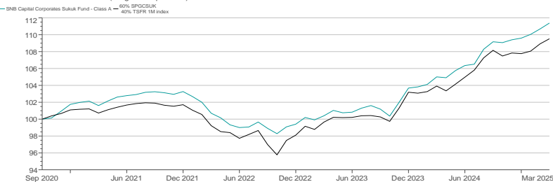
Manager Performance October 2020 - March 2025 (Single Computation)