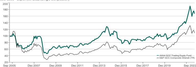
Manager Performance October 2005 - September 2022 (Single Computation)