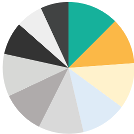
Top 10 Holdings