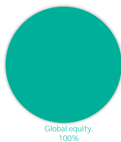
ASSET DISTRIBUTION BY GEOGRAPHICAL