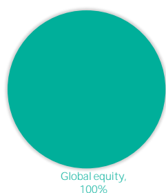
ASSET DISTRIBUTION BY GEOGRAPHICAL