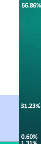
INVESTOR NATIONALITY & INVESTOR TYPE